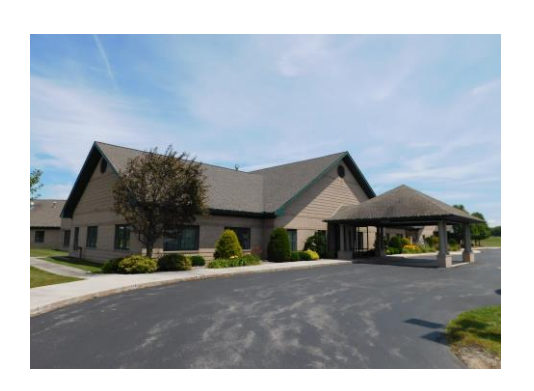
Children's Aid Home Programs Wheeler Campus